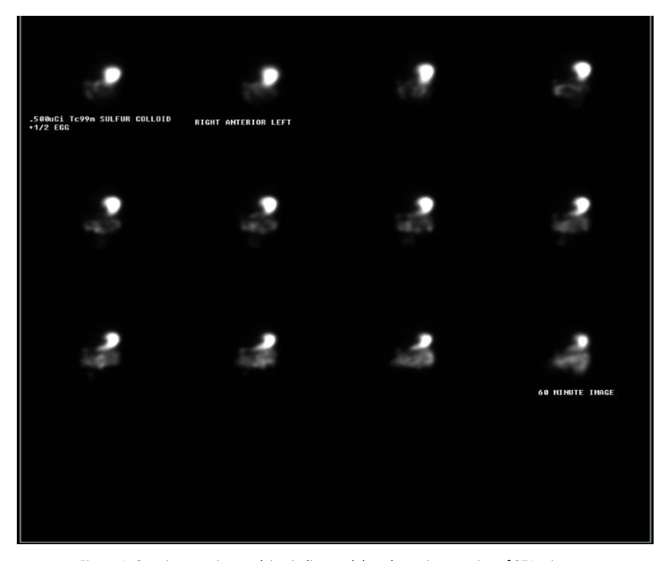
Figure 1. Gastric emptying studying indicates delayed gastric emptying of 271 minutes.

In the hospital he continued to have nausea and multiple episodes of vomiting during the day; initially, multiple trials to insert a transpyloric feeding tube by interventional radiology (IR) failed. Eventually, IR was able to place a weighted nasoduodenal feeding. He tolerated feeding increments up to 45 cc/hr via the feeding tube. After consulting with pediatric gastroenterologist, the patient was transferred into their care. A gastroenterologist proceeded to endoscopically dilate his pylorus due to