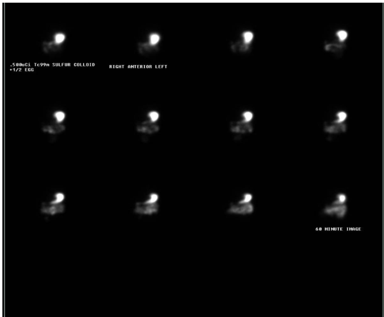
Figure 1. Gastric emptying studying indicates delayed gastric emptying of 271 minutes.

In the hospital he continued to have nausea and multiple episodes of vomiting during the day; initially, multiple trials to insert a transpyloric feeding tube by interventional radiology (IR) failed. Eventually, IR was able to place a weighted nasoduodenal feeding. He tolerated feeding increments up to 45 cc/hr via the feeding tube. After consulting with pediatric gastroenterologist, the patient was transferred into their care. A gastroenterologist proceeded to endoscopically dilate his pylorus due to